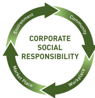
Figure 13. Corporate Social Responsibility chart

Developing and implementing a socially responsible marketing plan is beneficial for the growing businesses in the footwear sector.