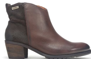
Figure 12. Example of eco-friendly boots