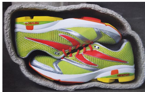
Figure 10. Eco-friendly shoe box

This online course is designed in such a way that the problem of packaging in relation to the environmental protection in the footwear industry is presented in a comprehensive manner, from the basic to the wider aspect of its development. The purpose of this course is also to present case studies from the footwear industry and to provide guidance for the design and development of modern packaging, because the process of development without using environmental criteria does not suffice any more.