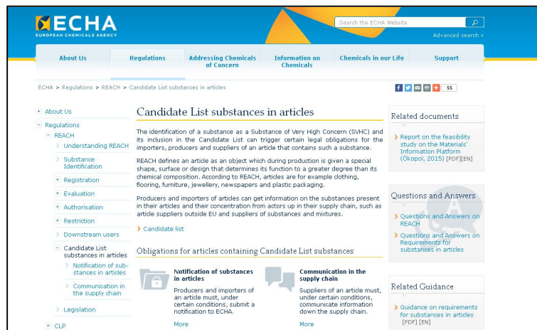
Figure 8. Website of the European Chemicals Agency

Furthermore, this unit describes some authorities and competent inspection bodies established in the European Union to control the compliance with the REACH Regulation.