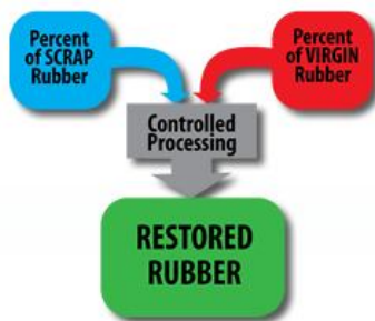
Figure 5. Eco-friendly soling solutions

After a short introduction to “Sustainability in the Footwear Industry” in chapter 1, chapter 2 explains what the important points in the pre-production phase are. Chapters 3 to 8 focus on the production departments from Cutting to Finish, giving explicit recommendations for technicians and workers.