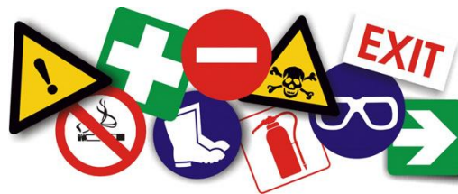
Figure 7. Health and safety signage

It includes mainly legislation on HSW, corporate health and safety policy and strategy, HSW planning and risk management, emergencies and reporting procedures, fire protection in the workplace, principles of safety work on machines and technical equipment, handling of hazardous chemicals and products in the workplace and process risks in the footwear industry.