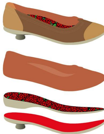
Figure 3. Scheme of shoe parts

Additionally, new solutions are being developed to enhance the products properties and functionalities.