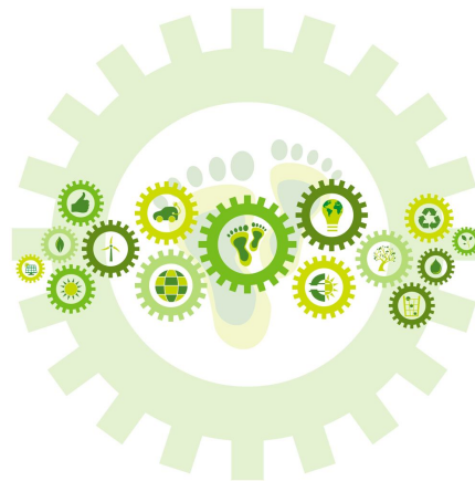
Figure 11. Sustainable supply chain

The course also presents, that the concept of the sustainable supply chain is becoming a true global trend. Nevertheless, the environmental aspect is still too often neglected compared to the economic benefit of individual company.